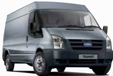
Transit LWB 300 2.2 TDCi

UP TO £6,542 OR ONLY £52.99 Customer saving Per week*