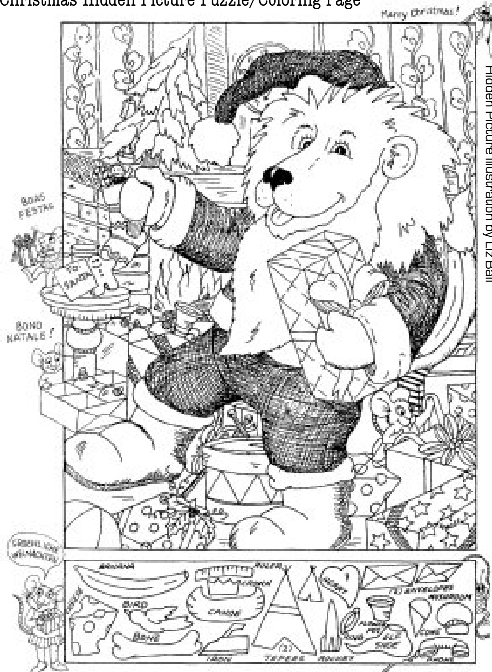
Hidden Picture illustration by Liz Ball

Find these hidden items in the picture above and then colour the page in for fun!