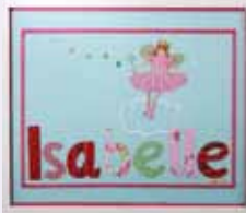
Personalised wall hanging designed by Sweetpea & Rose