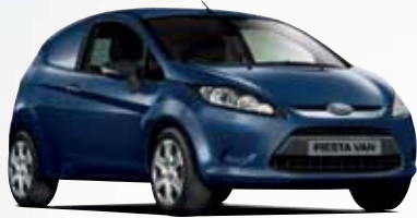
Fiesta Van 1.4 TDCi

SAVE UP TO £7,390 on a new Ford Van this Winter!