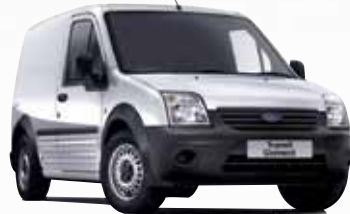
Transit Connect 200 1.8 TDCi

UP TO £2,079 OR ONLY £42.99 Customer saving Per week*