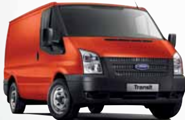
Transit SWB 260 2.2 TDCi

UP TO £4,131 OR ONLY £48.99 Customer saving Per week*